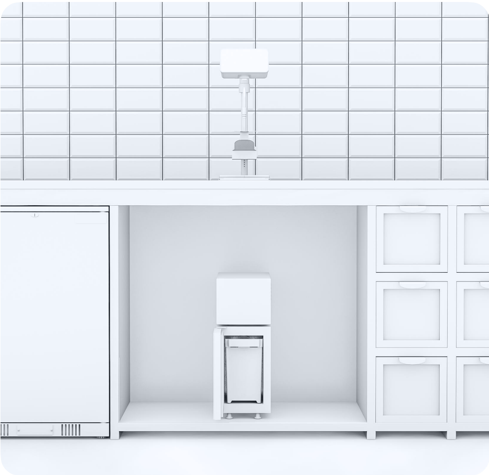
Standard fridge setup with 3.7L (1 gal) container