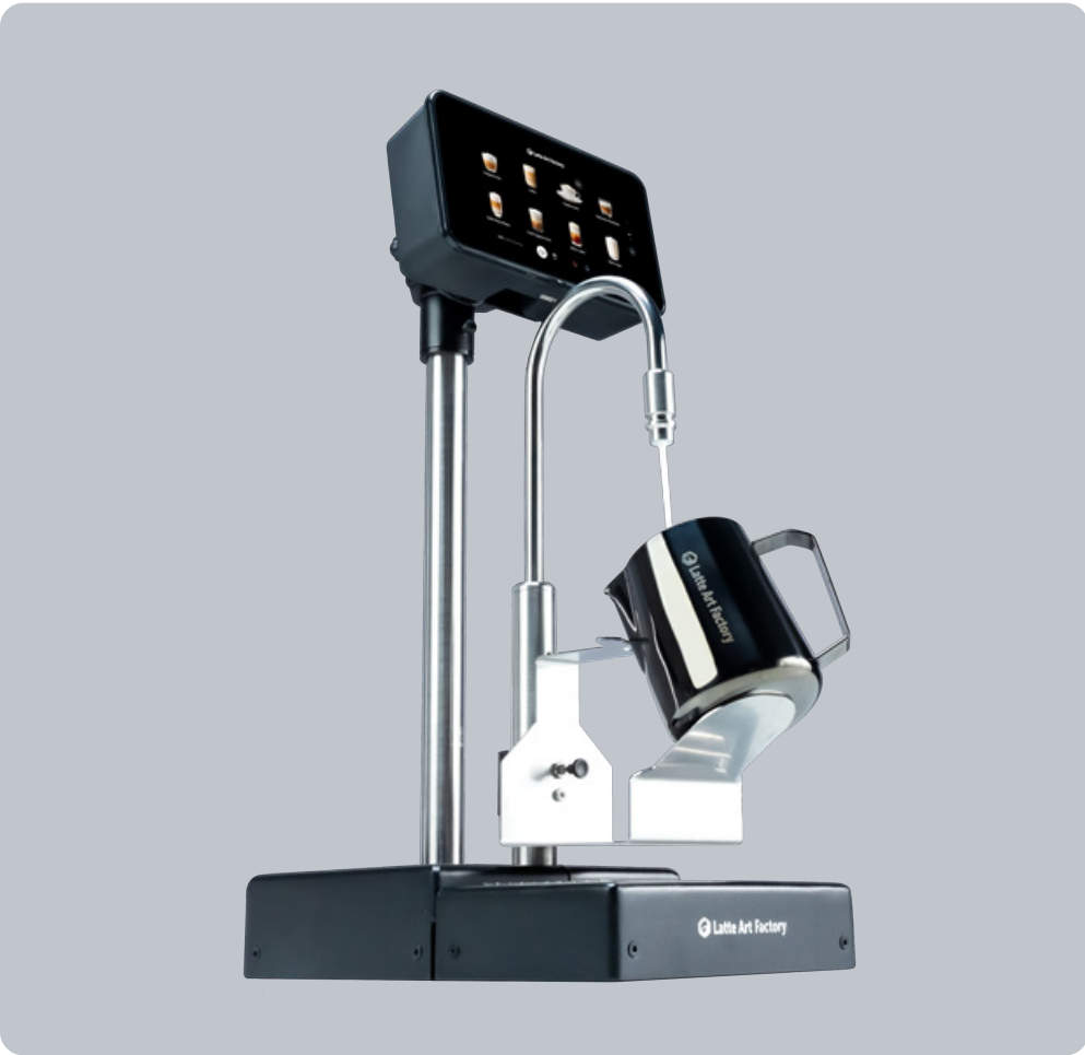
LAF Bar – fridge and module under the counter