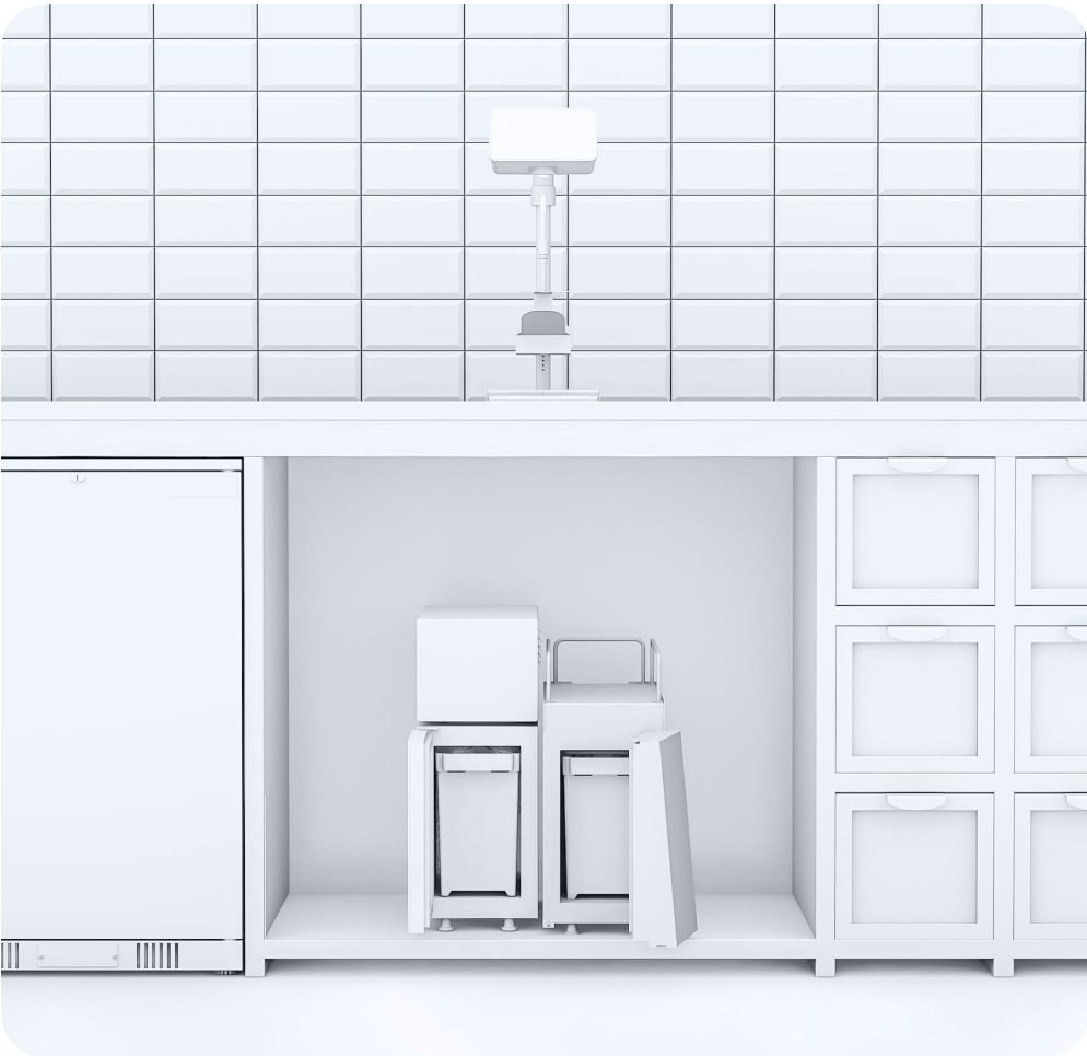
Extra fridge setup: 2x 3.7L (1 gal) containers