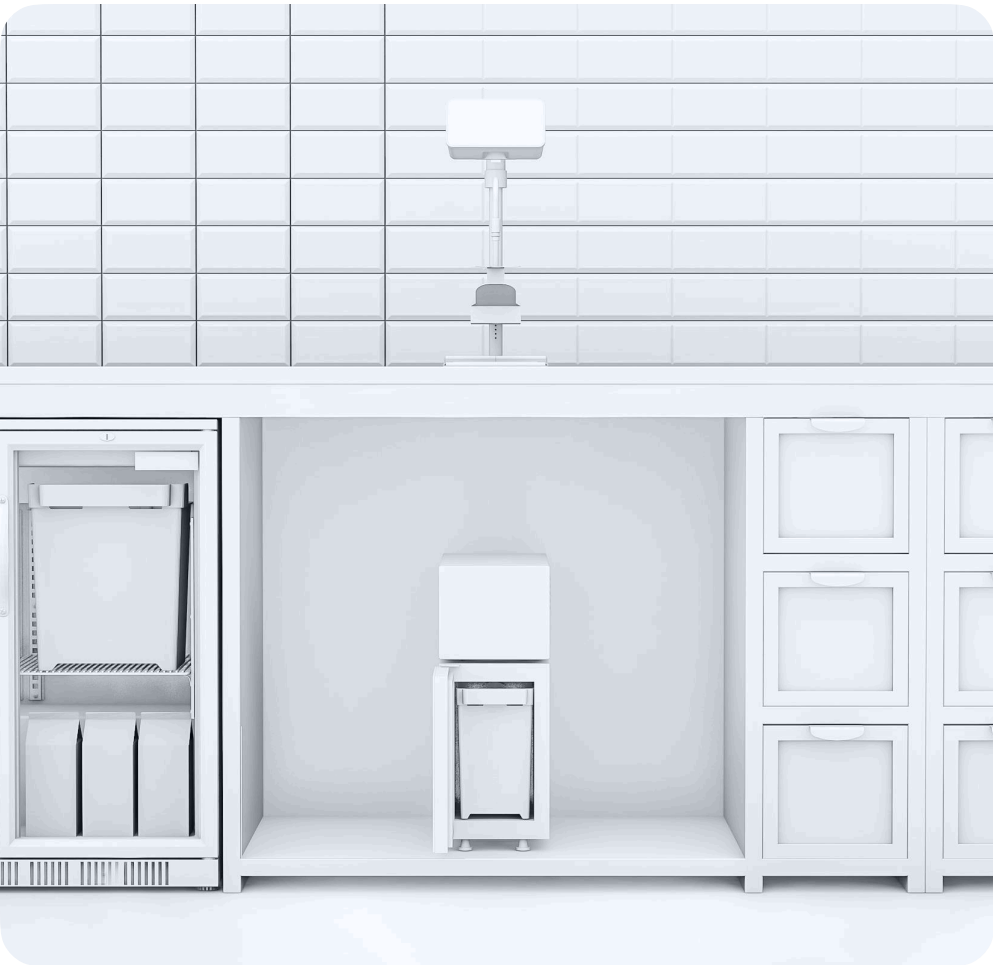
Custom setup: 3.7L (1 gal) container + custom fridge